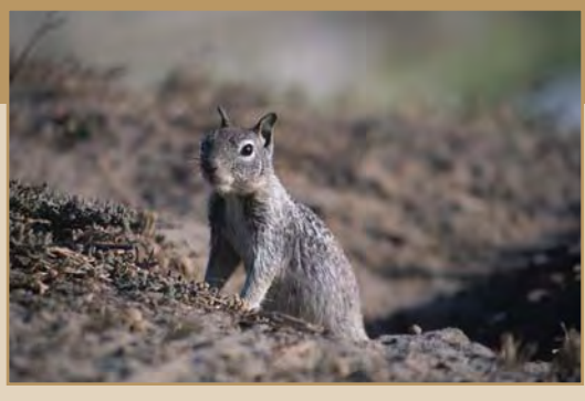
California ground squirrel

Species Account U.S. Fish and Wildlife Service, Sacramento Fish and Wildlife Office. http://www.fws.gov/sacramento/es/animal_spp_acct/sj_kit_fox.pdf