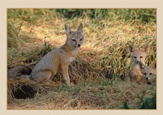
San Joaquin kit fox family