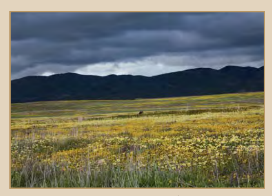
Carrizo Plain