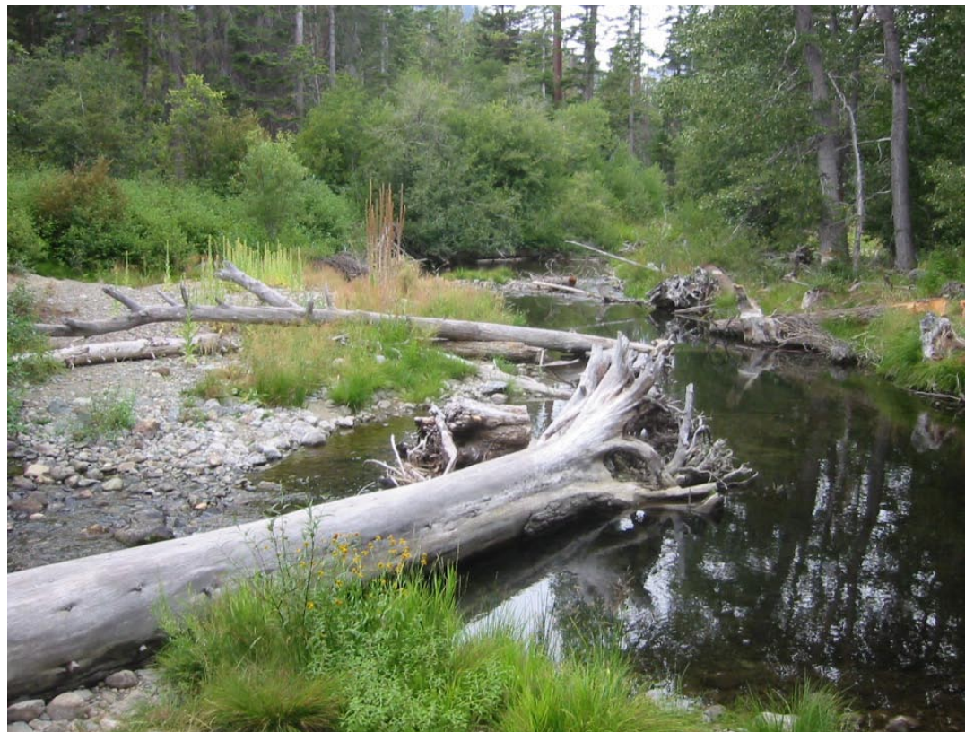
Figure 1. Large woody debris (LWD) creates important habitat for fish and other aquatic species.

Recent research has confirmed that LWD plays a vital role in many stream ecosystems, helping to control the very shape of the channel and providing cover, shelter, and feeding opportunities for aquatic organisms. Unfortunately, California's streams have lost much of their large wood as a result of human actions. At the same time, the forests and woodlands that should have provided a continuing natural source of LWD in the future have been altered. Now that the role of wood in streams is better understood, land managers and resource agencies have begun both to restore LWD itself and to improve LWD recruitment on timberland. The importance of instream wood is not restricted to timberland, though: LWD is an important natural resource across a diverse range of California's streams. This publication is intended to provide LWD information for non-timber landowners including ranchers, farmers, and rural and suburban residents.