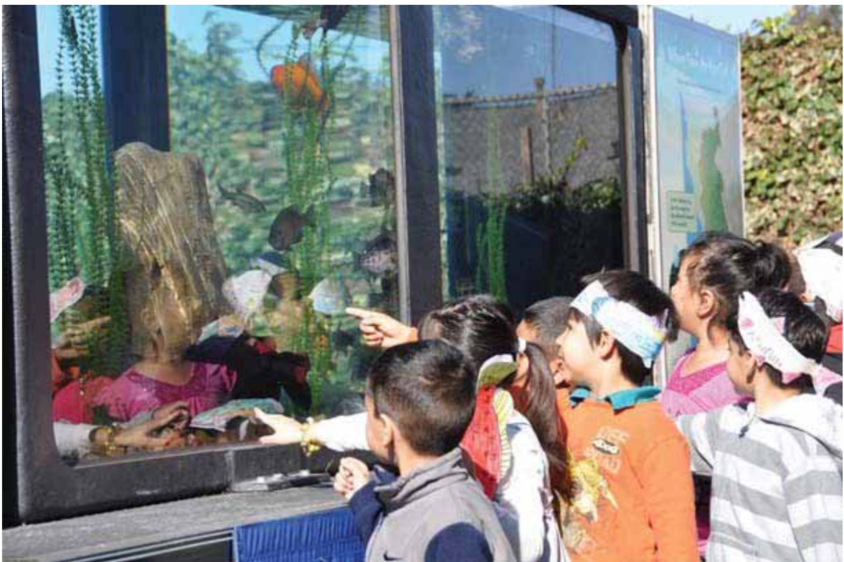
Thanks to the Park District's mobile fish exhibit, students at Monroe Elementary School in San Leandro get to learn about native freshwater fish that were once plentiful in the East Bay streams and ponds.

They while away the hours in a nondescript building on the Alameda shore, waiting for their chance to wow the crowds. Not that they spend much time thinking about fame and glory. They are, after all, fish, and like most fish they are preoccupied with finding food, seeking secure environs, and, at certain junctures, mating.