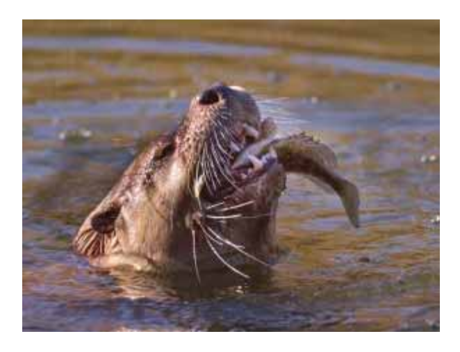
A river otter grabs a snack of Sacramento perch at Jewel Lake.

Jewel Lake in Tilden Park.