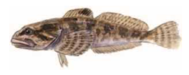
Prickly sculpin. Drawing by: John Muir Laws

While scattered ponds and lakes are the last strongholds for Sacramento perch, the East Bay's creeks serve as primary habitat for most of the region's other native freshwater fish species. Of these, Alameda Creek is by far the most significant. Indeed, Alameda Creek might be more properly termed a river: It runs 45 miles from the slopes northeast of Mount Hamilton through Niles Canyon to San Francisco Bay, draining approximately 700 square miles of uplands.