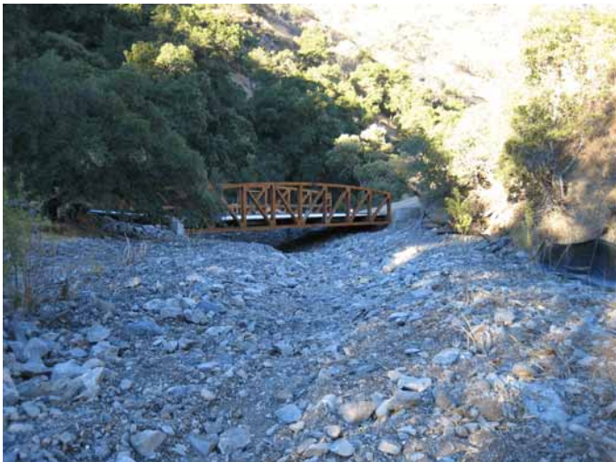
New Mocho Bridge

As promised 2 issues ago, here are photos of the Lawrence Livermore National Laboratory's Arroyo Mocho Road Improvement and Anadromous Fish Passage Project, completed in fall of 2004. LLNL removed a cement stream crossing 160 feet long and 40 to 80 feet wide from Arroyo Mocho that had eroded and was in danger of failure due to undermining by the stream, creating impassable conditions for trout and migratory fish. LLNL replaced the crossing with a free standing bridge, preserving habitat and restoring the natural flow characteristics of the stream.