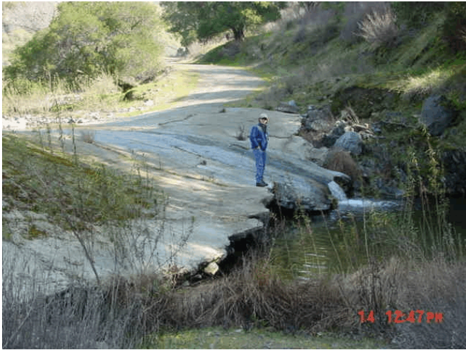
Cement stream crossing before

As promised 2 issues ago, here are photos of the Lawrence Livermore National Laboratory's Arroyo Mocho Road Improvement and Anadromous Fish Passage Project, completed in fall of 2004. LLNL removed a cement stream crossing 160 feet long and 40 to 80 feet wide from Arroyo Mocho that had eroded and was in danger of failure due to undermining by the stream, creating impassable conditions for trout and migratory fish. LLNL replaced the crossing with a free standing bridge, preserving habitat and restoring the natural flow characteristics of the stream.