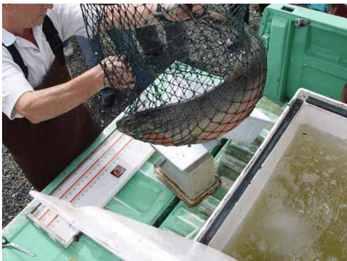
"Brutus" weighed in at 11 pounds

Steelhead trout seen in lower Alameda Creek on December 29 th and 30 th were likely blown out by the historic New Year storm, which brought Alameda Creek flow up to 10,000 cubic feet/second in lower Niles Canyon and 18,000 cfs in the flood control channel in Union City!!!! Steelhead were again seen at the weir on March 3 rd . On March 4 th ACA volunteers and the East Bay Parks biologist, with cooperation from the Alameda County Water District and Alameda County Flood Control District, helped rescue two adult males from below the BART weir and move them upstream into Niles Canyon. One of the fish, given the name "Brutus", was the largest steelhead documented yet in the creek, weighing 11 pounds and measuring 31 inches. More steelhead were spotted at the weir on March 8 th as this goes to press.