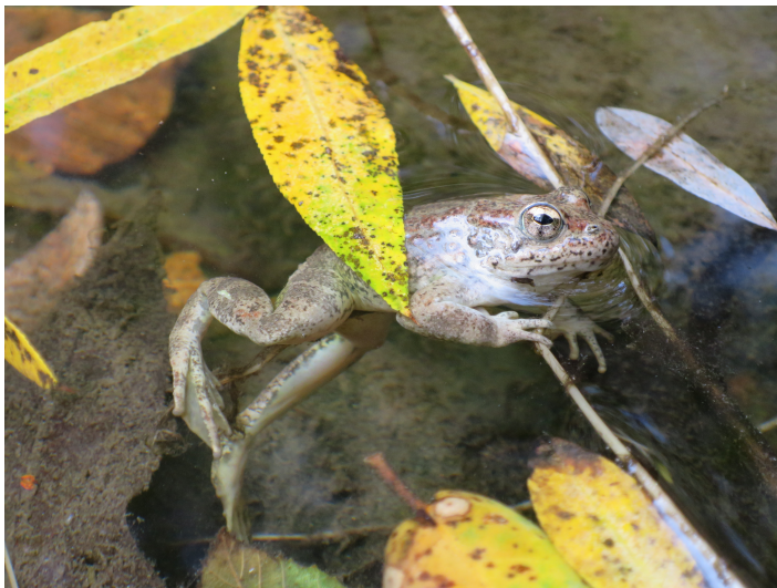
Foothill Yellow-legged Frog (Rana boylei) in Alameda Creek, 2014.

The SFPUC has paid much attention to balancing the needs of providing drinking water with restoring anadromous salmonids to Alameda Creek. We hope that the needs of the system's diverse herpetofauna will similarly be considered when evaluating the effects of this project. We urge the SFPUC to uphold its Environmental Stewardship Policy, which states that it will "protect and restore native fish and wildlife downstream of SFPUC dams and water diversions" (emphasis added). Unfortunately the scoping document (on page 10) excludes two special-status taxa which are extant in the ecosystem and currently undergoing review by the US Fish and Wildlife Service for listing under the federal Endangered Species Act. SAVE THE FROGS! expects that potential impacts on these stream dwellers, the foothill yellow legged frog ( Rana boylei ), and the Western pond turtle ( Emys marmorata ), will be fully addressed in the EIR. In addition to sensitive and special status taxa, the potential impacts of the ACRP on non-native taxa known to have detrimental effects on native species should also be included in the review. Because protecting ecosystem function also encompasses the goal of keeping common species common, we hope that all amphibians in the creeks will be assessed for potential impacts. These include the Western toad, the Pacific chorus frog, and the California newt.