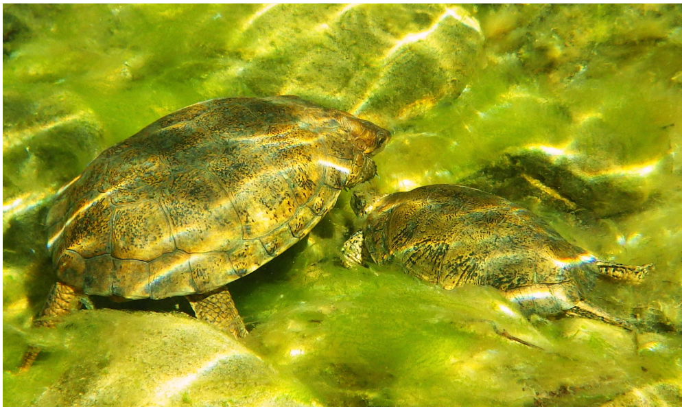
Western pond turtles (Emys marmorata) in Alameda Creek, spring 2015.