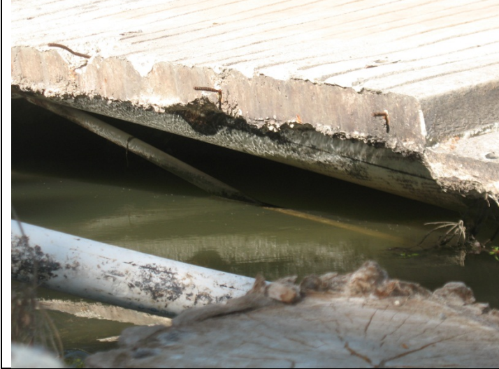
Figure 7. Additional perspective on Work Area #1. Notice how the section is suspended above the waterline. The PVC pipes in view are no longer in use.