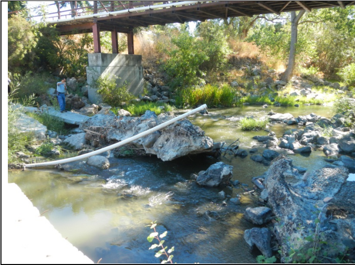
Figure 12. View of Work Areas #2 and #3. Notice that this slab (work area #3) was overturned by the force of the channel flow last winter, and its mostly resting atop sediment and other rocks.