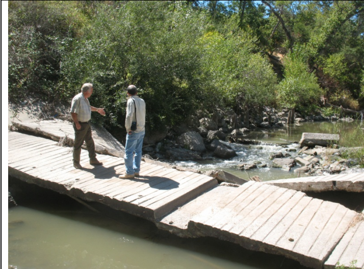
Figure 8. Additional perspective on Work Area #1, looking upstream. Notice how the section is suspended above the waterline and that there is little grade difference immediately upstream and downstream of the structure.