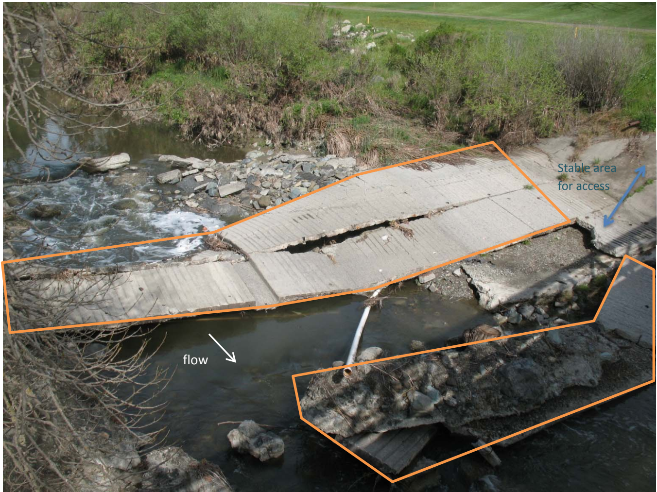
Figure 6. Limits of Work. The attached, stable areas of concrete on either bank will not be removed or altered. Photo date: 3/20/2013