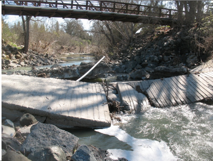
Figure 9. Additional perspective on Work Area #1, looking downstream. Notice that the uppermost part of this suspended section has broken apart midway due to lack of support underneath.