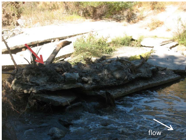
Figure 5. Woody debris jam. Side view (left) and upstream view (right) of Work Area #3, where four trees or limbs have become wedged and could cause a beaver dam effect. Photo on right further demonstrates how water is able to maneuver underneath the slab likely due to rip rap on channel bottom. Photo date: 9/23/2013