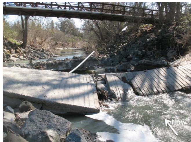
Figure 3. Upstream (left) and Downstream (right) Surroundings. Notice the abundant rip rap and concrete material in stream that is not associated with this concrete structure.