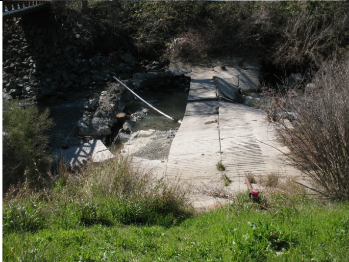
Figure 10. View across the channel. Flow is from right to left in this view, and notice that summer flow passes underneath the main structure.