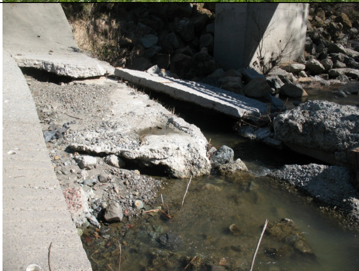
Figure 11. View of Work Area #2. Notice that this slab is fully detached from the main structure and resting at an angle upon other materials, above the channel bottom and above the water line.