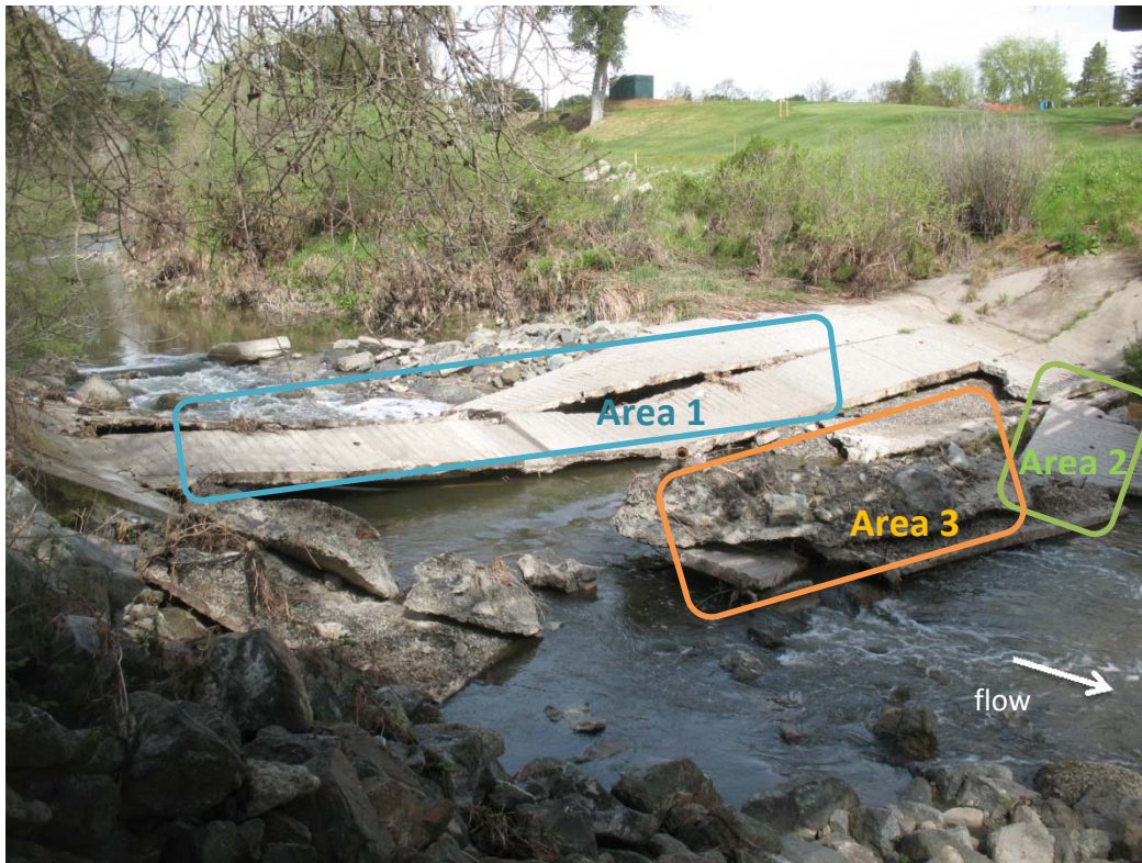
Figure 2. Upstream View of Castlewood Concrete Structure Work Areas