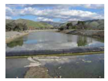
Inflatable dam in Alameda County flood control channel.

Slowing down the floods of runoff from upstream could help the creek function more sustainably, but to do so will require softening the pavements in Livermore, Pleasanton, Dublin and San Ramon, among other low impact development (LID) and green infrastructure actions. Creeks in the watershed also flow through golf courses, some with culverts or riprap that increase the speed of flows, others that are allowing their greens to be used as floodplain. "Flows are so huge from this valley LID alone won't be able to attenuate them," says Koenig. She hopes other solutions will come out of the Alameda Creek Watershed Forum and Arroyo de la Laguna Collaborative. "Our goal is to do more than just soft band-aids," she says.